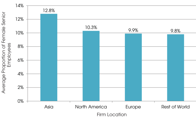
Fig. 1: Female Senior Employees as Proportion of Total by Firm Location

Women account for an average of 8.7% of the team at private equity firms with five or fewer senior employees, a decrease compared to the 9.2% women accounted for at these firms last year. Women accounted for an average of 10.6% of senior staff at firms of 6-10 employees, and 10.7% and 11.9% at private equity firms with 11-20 and 21+ members of staff respectively.