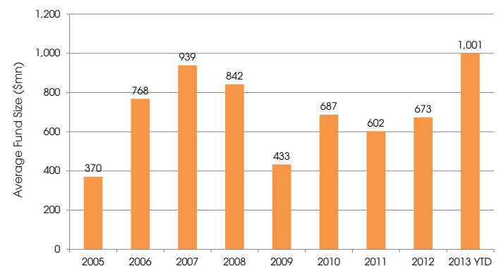
Fig. 4: Average Fund Size of Unlisted Infrastructure Funds Closed Each Year, 2005 - 2013 YTD (As at 7 June 2013)