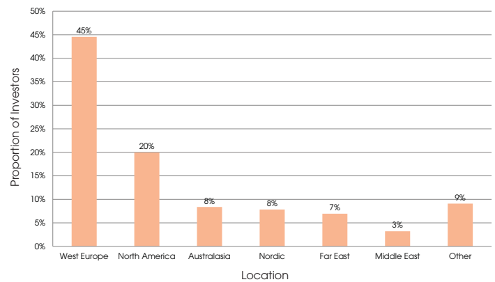
Fig. 2: Breakdown of PPP/PFI-Focused Infrastructure Investors by Location