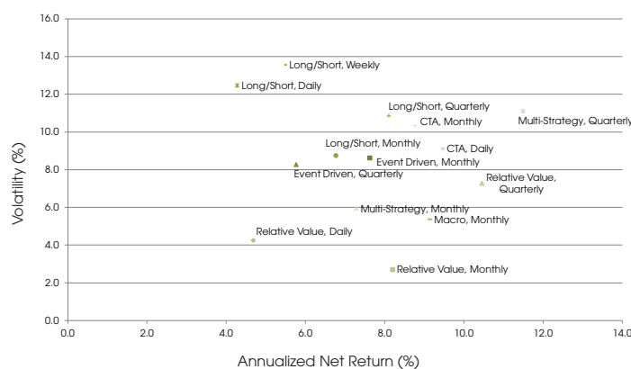
Fig. 5: Comparison of Hedge Fund Risk-Return Profiles by Strategy and Redemption Frequency, January 2007 - October 2012